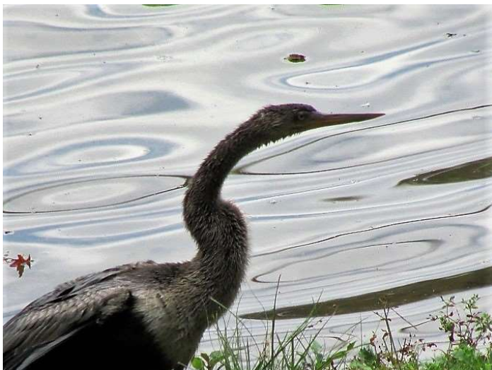
Anhinga spreads wings to dry.